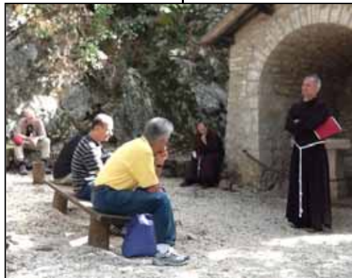
Soul searching at outdoor chapel

our own thoughts, reflecting on our own lives and improving our own faith. The path takes us to the back of the mountain to a beautiful outdoor chapel. We sit in silence letting our souls reflect. I share with everyone just a few points about soul searching. Our soul by its own nature searches for its own path. Its best friend on this journey is silence because silence is where we might participate in the most important conversation with God and our own self. Silence defines our very character. Listening is an act of communication. Souls that are ready to listen find wisdom. Francesco teaches us that we have to do this in order to understand ourselves. Silence taught him and teaches us three important fundamentals of our spirituality - humility, unselfishness, and service. Our spiritual needs